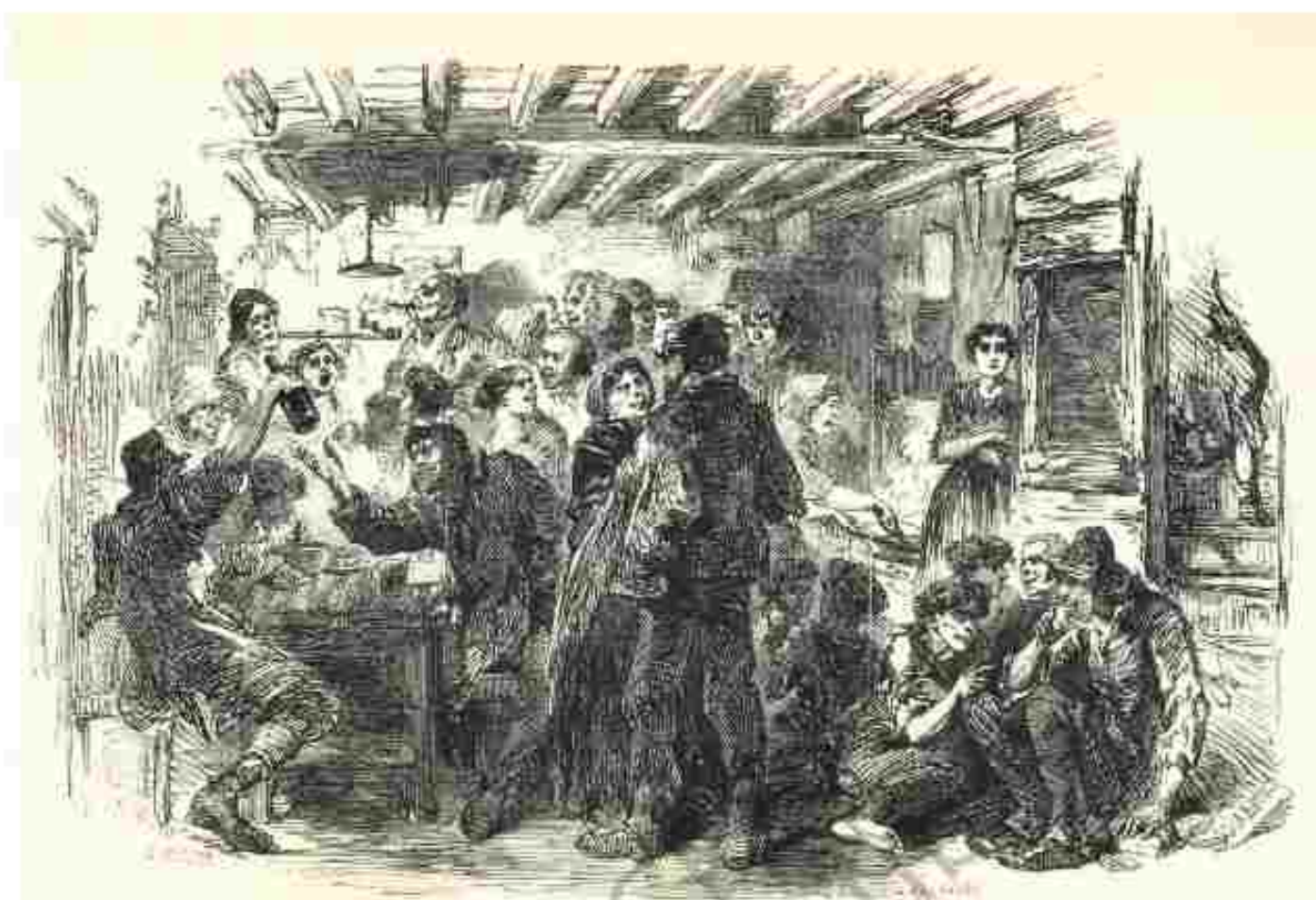
Fig. 1 - The London poor in the mid-nineteenth century as seen by a contemporary.

From: Henry Mayhew, London Labour and the London Poor, 1861.