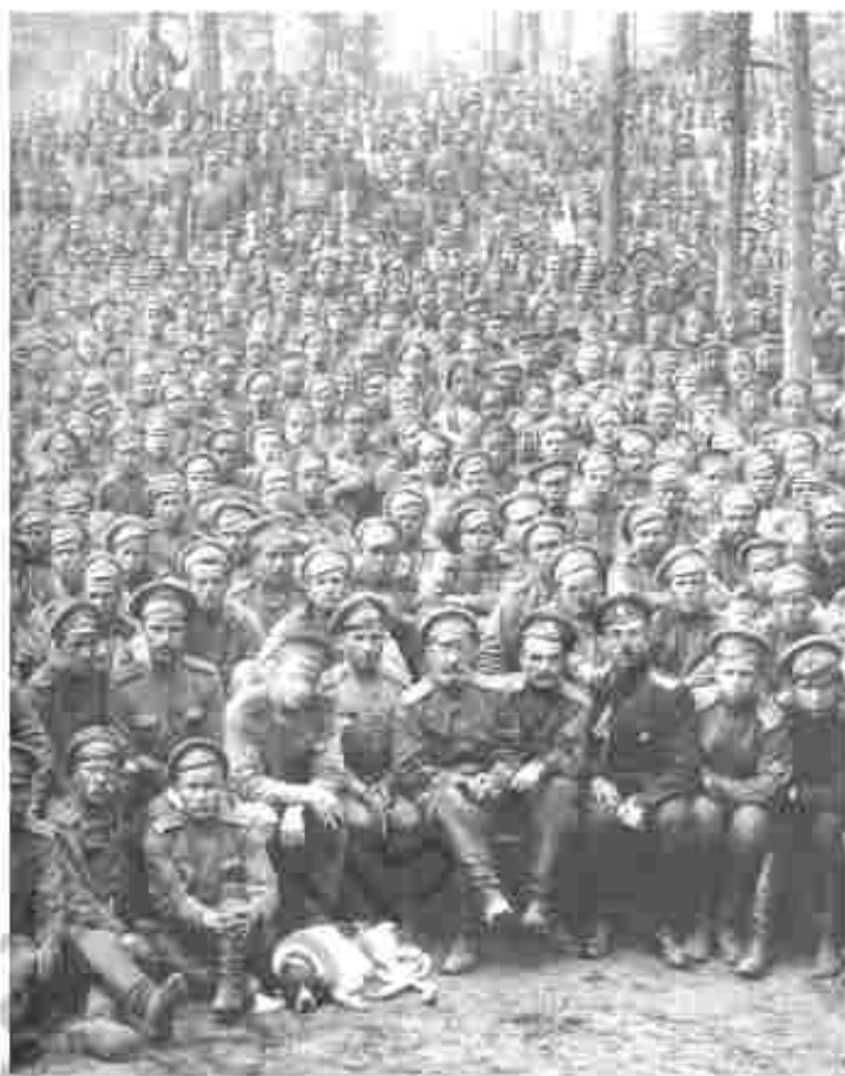
Fig. 7 – Russian soldiers during the First World War.

The war also had a severe impact on industry. Russia's own industries were few in number and the country was cut off from other suppliers of industrial goods by German control of the Baltic Sea. Industrial equipment disintegrated more rapidly in Russia than elsewhere in Europe. By 1916, railway lines began to break down. Able-bodied men were called up to the war. As a result, there were labour shortages and small workshops producing essentials were shut down. Large supplies of grain were sent to feed the army. For the people in the cities, bread and flour became scarce. By the winter of 1916, riots at bread shops were common.