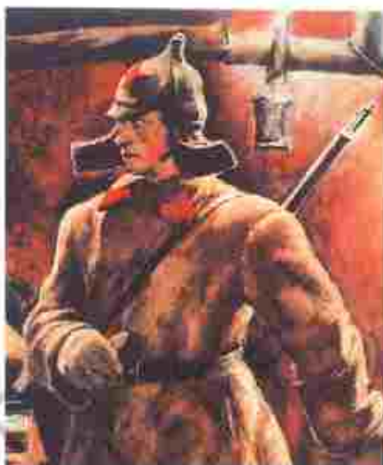
Fig. 12 – A soldier wearing the Soviet hat ( budenovka )

The Bolshevik Party was renamed the Russian Communist Party (Bolshevik). In November 1917, the Bolsheviks conducted the elections to the Constituent Assembly, but they failed to gain majority support. In January 1918, the Assembly rejected Bolshevik measures and Lenin dismissed the Assembly. He thought the All Russian Congress of Soviets was more democratic than an assembly elected in uncertain conditions. In March 1918, despite opposition by their political allies, the Bolsheviks made peace with Germany at Brest Litovsk. In the years that followed, the Bolsheviks became the only party to participate in the elections to the All Russian Congress of Soviets, which became the Parliament of the country. Russia became a one-party state. Trade unions were kept under party control. The secret police (called the Cheka first, and later OGPU and NKVD) punished those who criticised the Bolsheviks. Many young writers and artists rallied to the Party because it stood for socialism and for change. After October 1917, this led to experiments in the arts and architecture. But many became disillusioned because of the censorship the Party encouraged.