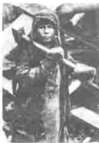
Fig. 16 – A child in Magnitogorsk during the First Five Year Plan.