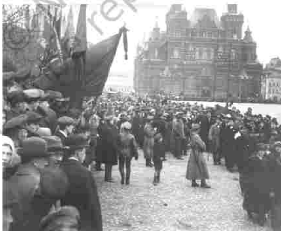
Fig. 13 – May Day demonstration in Moscow in 1918.