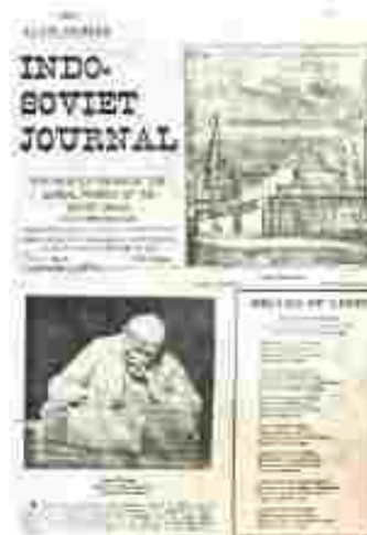
Fig. 20 – Special Issue on Lenin of the Indo-Soviet Journal. Indian communists mobilised support for the USSR during the Second World War.