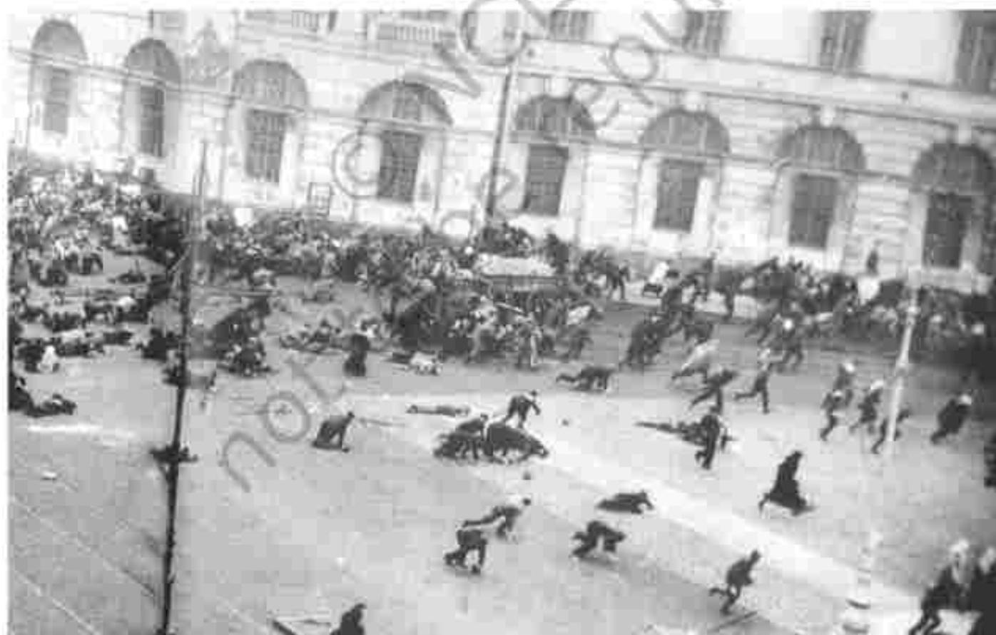
Fig.10 – The July Days. A pro-Bolshevik demonstration on 17 July 1917 being fired upon by the army.