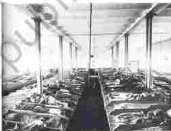
Fig. 6 – Workers sleeping in bunkers in a dormitory in pre-revolutionary Russia.

Many survived by eating at charitable kitchens and living in poorhouses.