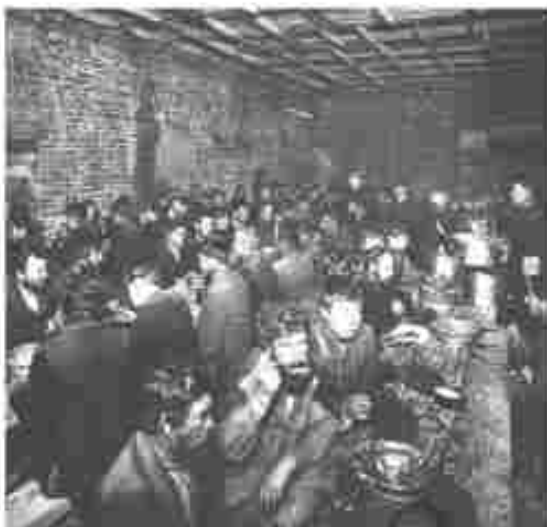
Fig. 5 – Unemployed peasants in pre-war St Petersburg.

In the countryside, peasants cultivated most of the land. But the nobility, the crown and the Orthodox Church owned large properties. Like workers, peasants too were divided. They were also