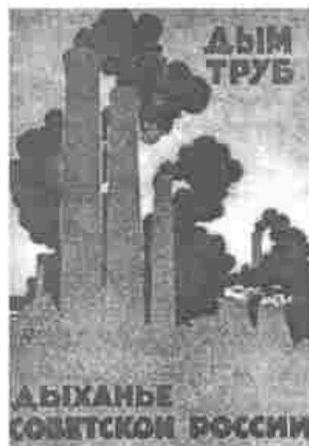
Fig. 14 – Factories came to be seen as a symbol of socialism. This poster states: 'The smoke from the chimneys is the breathing of Soviet Russia.'

An extended schooling system developed, and arrangements were made for factory workers and peasants to enter universities. Crèches were established in factories for the children of women workers. Cheap public health care was provided. Model living quarters were set up for workers. The effect of all this was uneven, though, since government resources were limited.