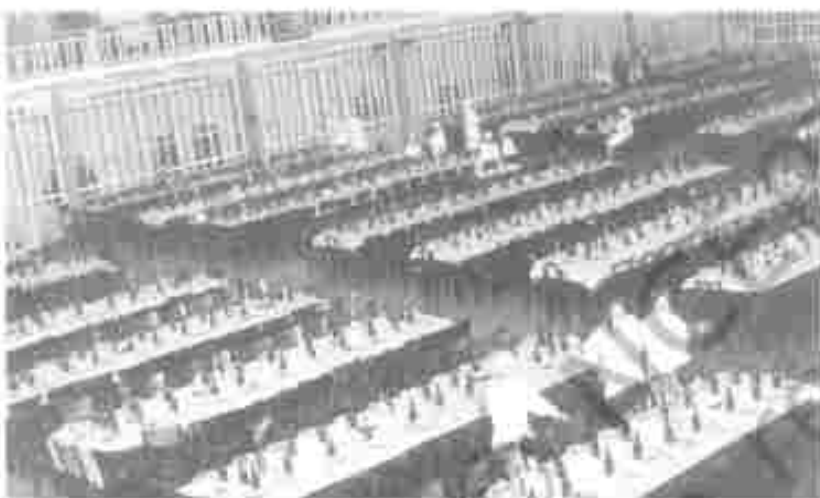
Fig. 17 – Factory dining hall in the 1930s.