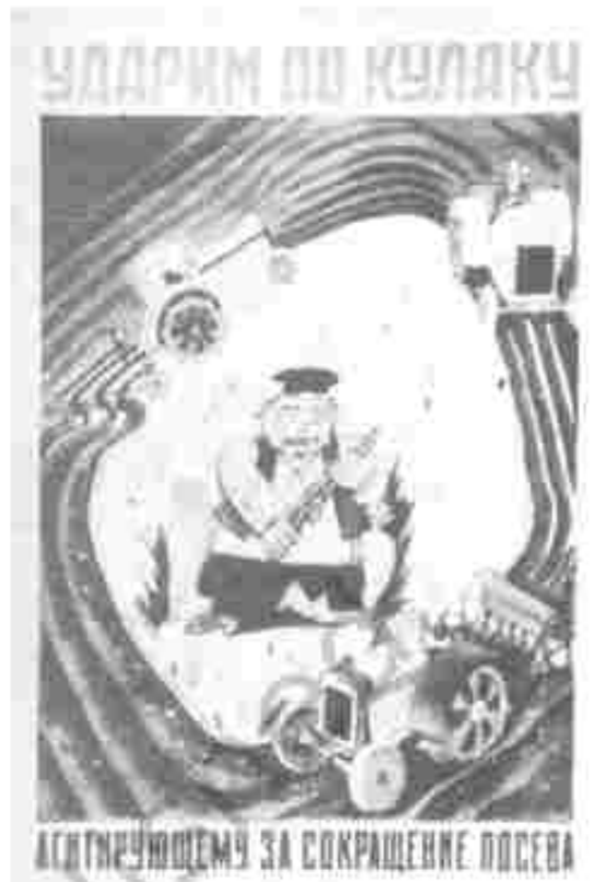
Fig. 18 – A poster during collectivisation. It states: 'We shall strike at the kulak working for the decrease in cultivation.'

Exiled – Forced to live away from one's own country.