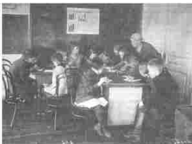
Fig. 15 – Children at school in Soviet Russia in the 1930s.