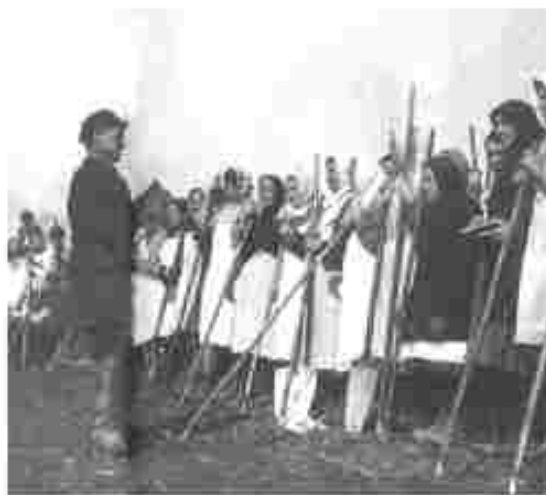
Fig. 19 – Peasant women being gathered to work in the large collective farms.