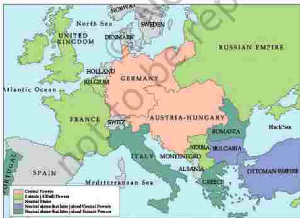
Fig. 4 – Europe in 1914.

The map shows the Russian empire and the European countries at war during the First World War.