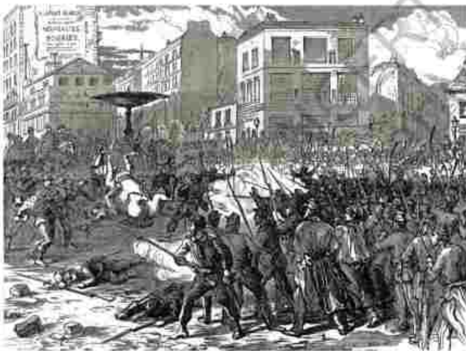
Fig.2 – This is a painting of the Paris Commune of 1871 (From Illustrated London News, 1871). It portrays a scene from the popular uprising in Paris between March and May 1871. This was a period when the town council (commune) of Paris was taken over by a 'people's' government consisting of workers, ordinary people, professionals, political activists and others. The uprising emerged against a background of growing discontent against the policies of the French state. The 'Paris Commune' was ultimately crushed by government troops but it was celebrated by Socialists the world over as a prelude to a socialist revolution. The Paris Commune is also popularly remembered for two important legacies: one, for its association with the workers' red flag – that was the flag adopted by the communards (revolutionaries) in Paris; two, for the 'Marseillaise', originally written as a war song in 1792, it became a symbol of the Commune and of the struggle for liberty.