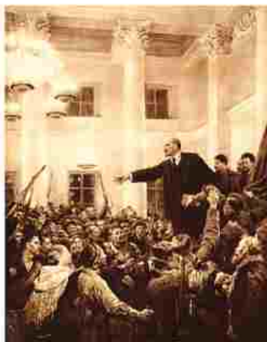
Fig.9 – A Bolshevik image of Lenin addressing workers in April 1917.

Meanwhile in the countryside, peasants and their Socialist Revolutionary leaders pressed for a redistribution of land. Land committees were formed to handle this. Encouraged by the Socialist Revolutionaries, peasants seized land between July and September 1917.